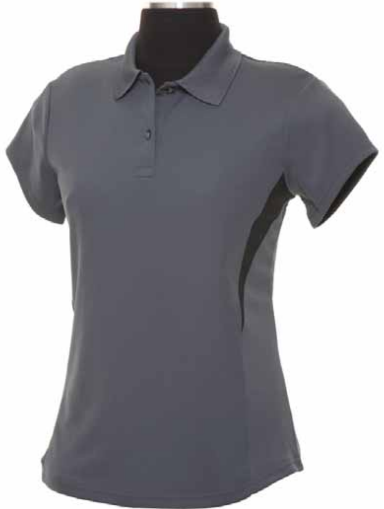
Color Shown: Canyon Grey/Black