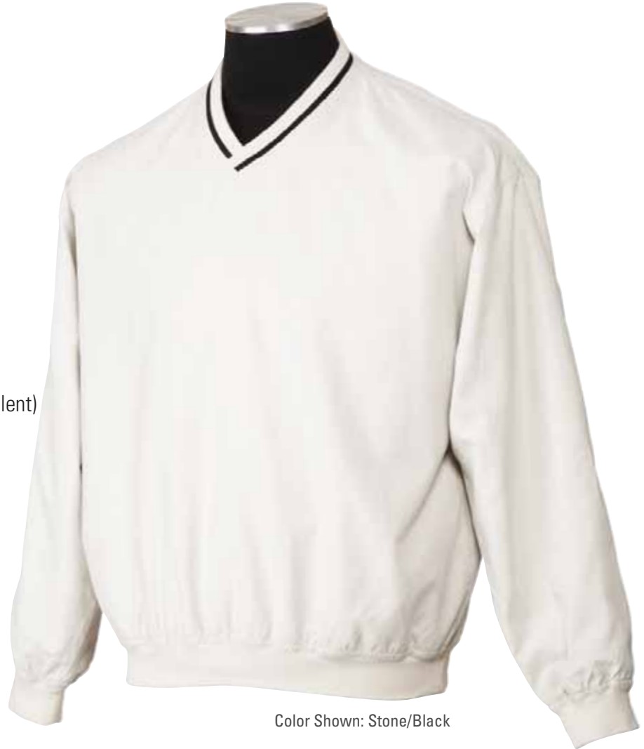
Color Shown: Stone/Black