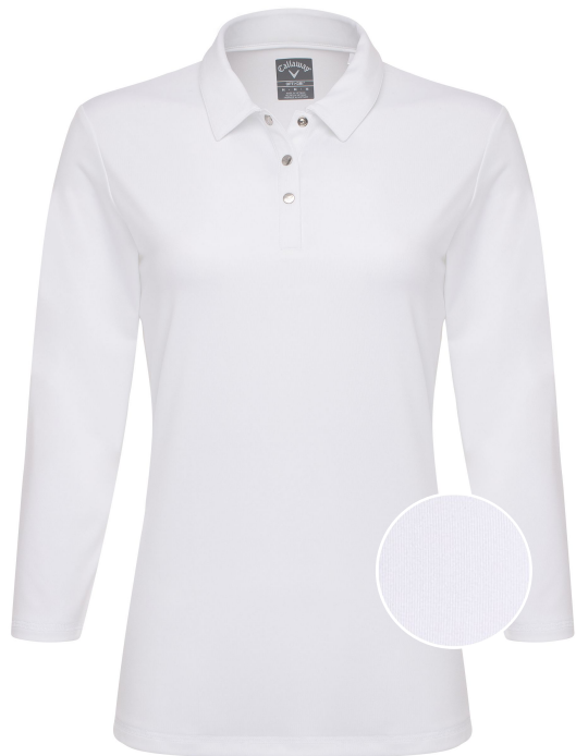
100 Bright White