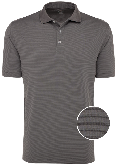
027 Smoked Pearl